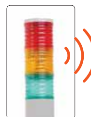
▲ Light tower