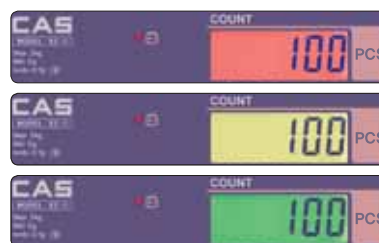
▲ Three backlight colors

Set the weight or count range and the EC-2 will indicate whether the actual weight or count is HI, LO, or OK, with alarm beep sounds and color display indicators. The optional Light Tower offers a larger visual alternative.