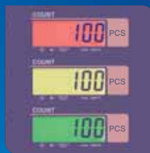
Three Backlight Colors